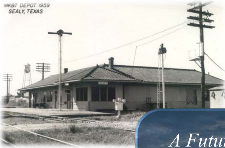
MK&T DEPOT 1959 SEALY, TEXAS